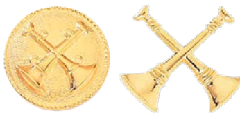
Example of Battalion Chief Brass (Left: Disk style / Right: Die Cut Style)

Firefighters and Engineers wear no collar brass on shirts, only their “Class A” jacket. Captains and above wear die-cut brass on shirts AND disks on “Class A” jacket.