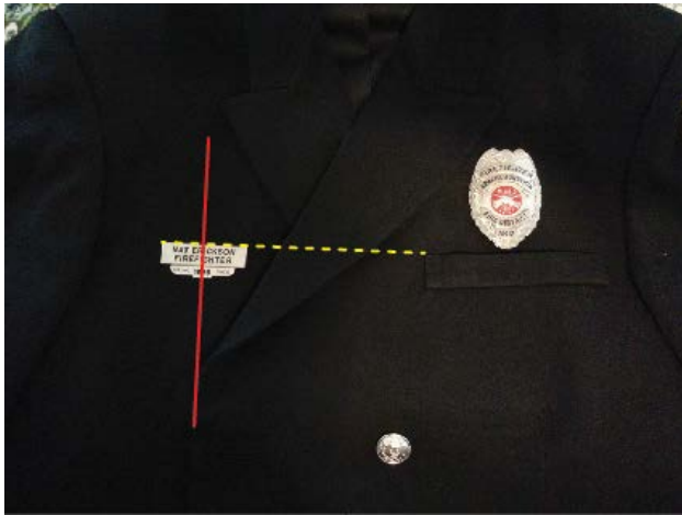
Class A Jacket

Your badges, nametags, serving since, and collar brass (rank specific) should be purchased from our uniform vendor according to established specifications. Collar brass (rank) on the “Class A” jacket should be on the collar (small flap), not the lapel (large flap), and aligned with the center of the insignia pointing towards the “point” of the collar. The disk should be ¼” off of both edges of the collar. On the “Class A/B” shirt, Captain and higher, the collar brass should align to the collar stitching, which is approximately ¼” from the edge of the collar, and oriented in the same manner as the jacket.