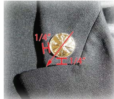
Class A Jacket

All nametags are standardized with First & Last name with rank below, and must have a “Serving Since” tag attached denoting the year of hire.